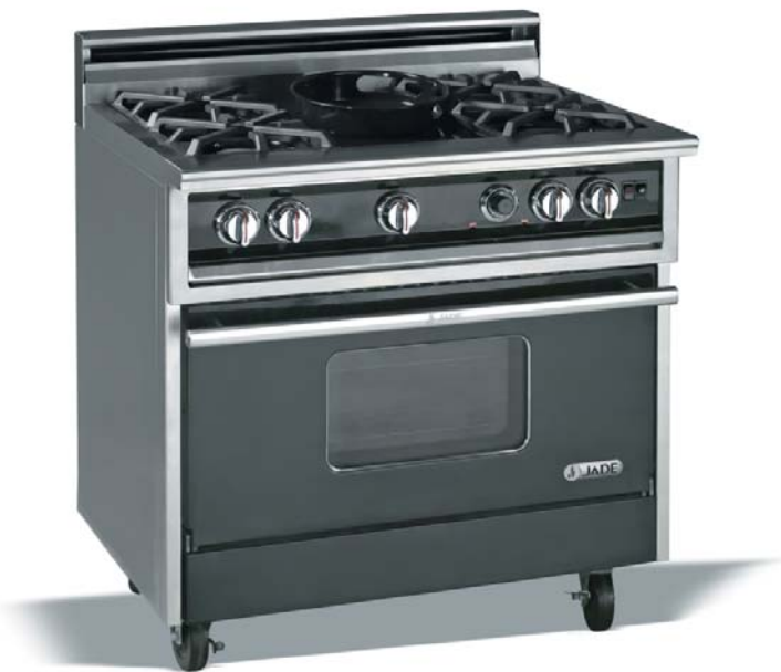
36" CLASSIC GAS RANGE

Model: RJGR3670C (NAT), RJGR3660C (LP) RJGR3671C (NAT), RJGR3661C (LP) RJGR3673C (NAT), RJGR3663C (LP) RJGR3674C (NAT), RJGR3664C (LP)