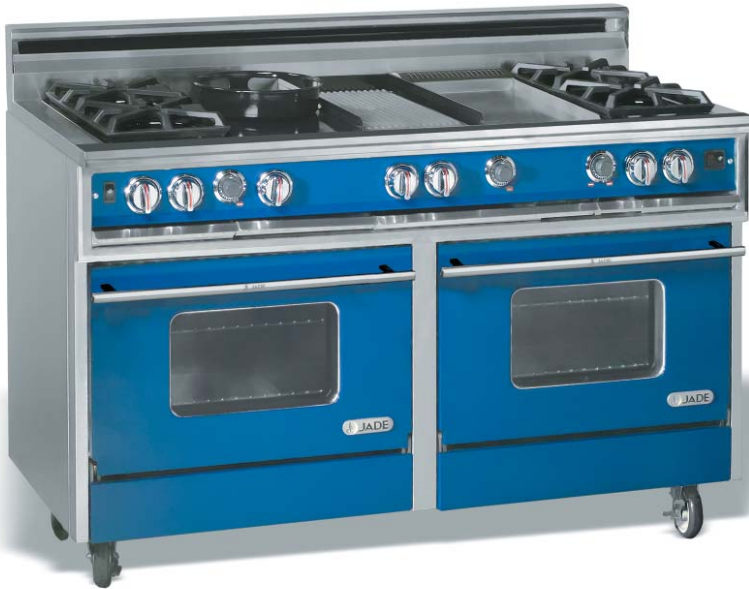
60" CLASSIC GAS RANGE

Model: RJGR6072C (NAT), RJGR6062C (LP) RJGR6075C (NAT), RJGR6065C (LP) RJGR6076C (NAT), RJGR6066C (LP) RJGR6077C (NAT), RJGR6067C (LP) RJGR6078C (NAT), RJGR6068C (LP)